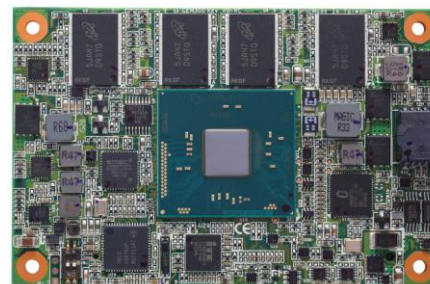
CEM300 Intel® Pentium® and Celeron® Quad/Dual-Core N3700/N3150/N3050 (Braswell) COM Express® Type 10 Mini Module

Following the COM Express® specification, Axiomtek released two COM Express® Type 10 mini modules – the CEM300 and CEM840. The COM Express® Type 10 module CEM300 features the latest generation Intel® Pentium® and Celeron® quad/dual-core (codename: Braswell) N3700/N3150/N3050 SoC processors. It comes with up to 8GB DDR3L memory onboard, 4~6 watts low power consumption, and provides improved graphics and computing performance. Integrated with Intel® Gen 8 graphics, the Axiomtek CEM300 provides excellent graphic performance including support for DirectX11.1, OpenGL 4.2 and ensures high-quality user experience with the latest 3D features and resolution up to 4k (3840 x 2160 @ 30 Hz). The rugged pocket-size CPU module features rich I/O interfaces, including four PCI Express lanes, two SATA-300, one Gigabit Ethernet, one HD audio link, and four digital I/O channels. With wide range voltage power input 4.75V - 20V, the Axiomtek CEM300 is an ultra mini option for users searching for a semi-custom and application-specific solution for harsh industrial environments.