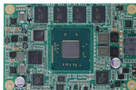
CEM840 Intel® Atom™ E3845/E3827/E3815 Quad/Dual/Single-Core (Bay Trail SoC) COM Express® Type 10 Mini Module

Another COM Express® Type 10 Module CEM840 features Intel® Atom™ processors E3845/E3827/E3815 (codename: Bay Trail SoC). It can carry up to 4GB DDR3L onboard memory and support a wide operating temperature range of -40°C to +85°C (-40°F to +185°F) for industrial applications. The Axiomtek CEM840 is equipped with various I/O interfaces, including one LPC, four PCIe x1, two SATA-300, one Gigabyte Ethernet supporting Wake-on-LAN, eight USB 2.0, one USB 3.0, HD audio, four digital I/O channels, one LVDS (18/24-bit single channel), and one DDI port. To enhance the reliability and stability of the board, hardware monitoring and Watchdog Timer are also supported.