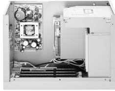
▲ Interior view