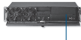
Flexible combination of drive bays for removable HDD CD-ROM, FDD, tape drive and hidden HDDs