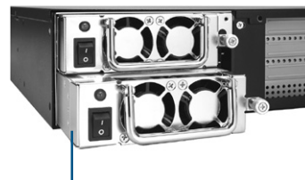
Optional hot-swap redundant power supply (only for AX61220TP)