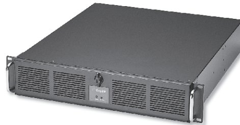
ATX6022/6VP4 backplane (up to 4 x PCI, 1 x ISA, 1 x PICMG)