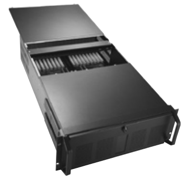
Dual top cover design for easy maintenance