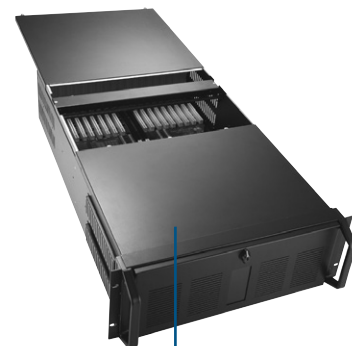
Dual top cover design for easy maintenance