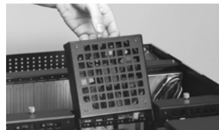
Built-in hot-swap fans