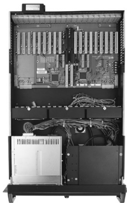
▲ Top view