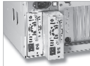
Optional hot-swap redundant power supply