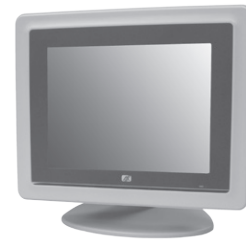
▲ Desktop stand